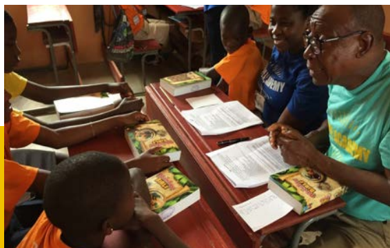
FOUNDATIONAL BIBLE TEACHINGS ROMANS 5:3-4

Fifty students (Grades 4 -9) were supported by over 20 volunteers (local teachers, and volunteers from Ghana and US). Donations of more than 600 books, various school supplies and games to support the camp activities were shipped in early summer. Like last year, t-shirts and meals (breakfast and lunch) were provided for the students and volunteers.