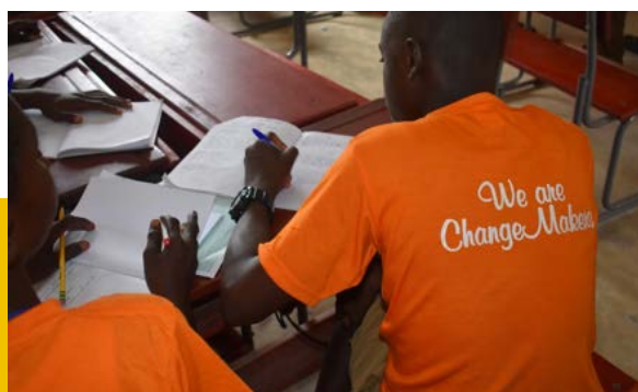
INVESTING IN YOUTH EXPERIENCE AND ENCOURAGEMENT